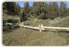
Simple barriers and signing can be very effective in controlling and directing the use.